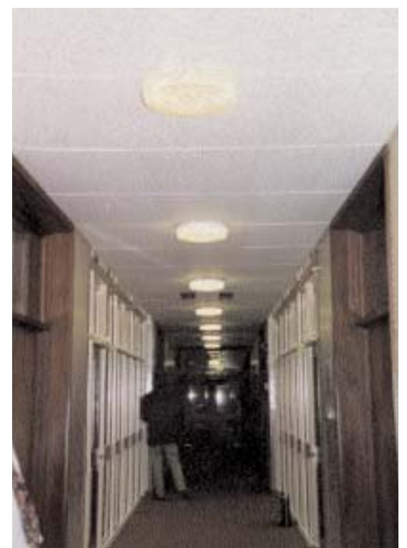
A typical asbestos insulation board ceiling.